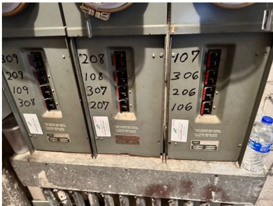
100 AMP BREAKERS