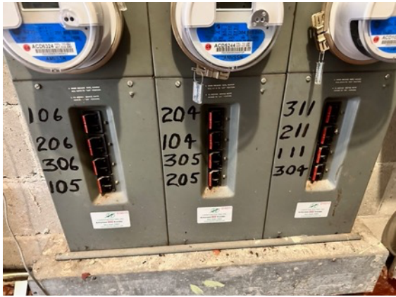
100 AMP BREAKERS