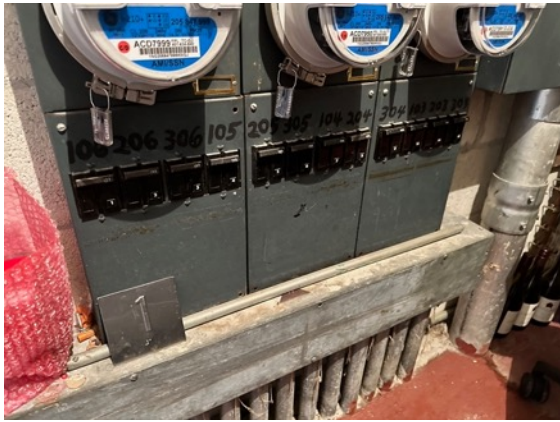
100 AMP BREAKERS