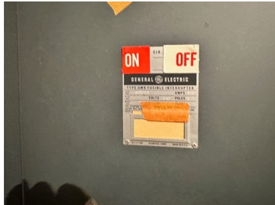
3- 600 AMP SERVICE MAINS