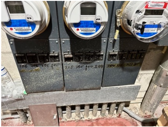
100 AMP BREAKERS