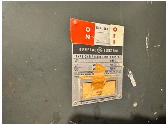
3- 600 AMP SERVICE MAINS