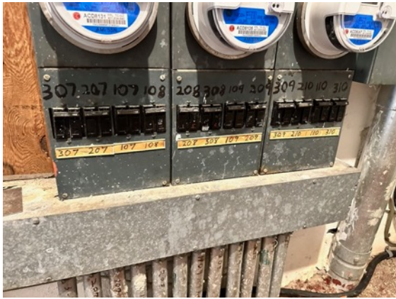
100 AMP BREAKERS