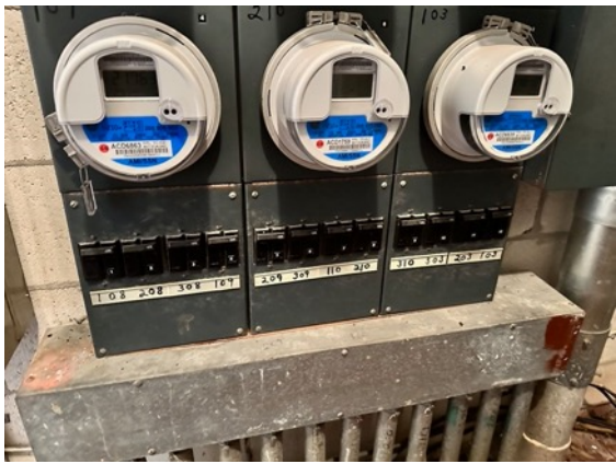
100 AMP BREAKERS