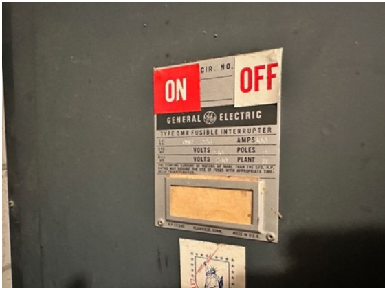
3- 600 AMP SERVICE MAINS