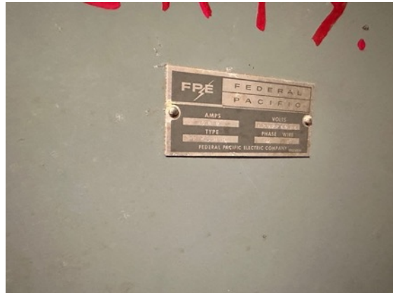
3- 600 AMP SERVICE MAINS