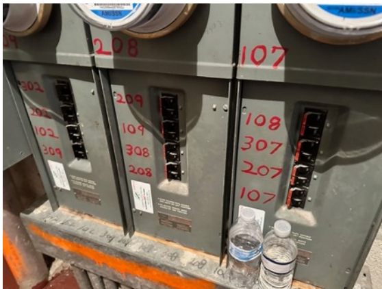
100 AMP BREAKERS