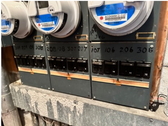
100 AMP BREAKERS