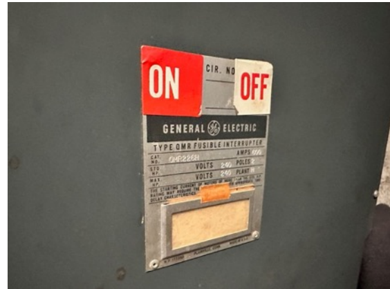
3- 600 AMP SERVICE MAINS