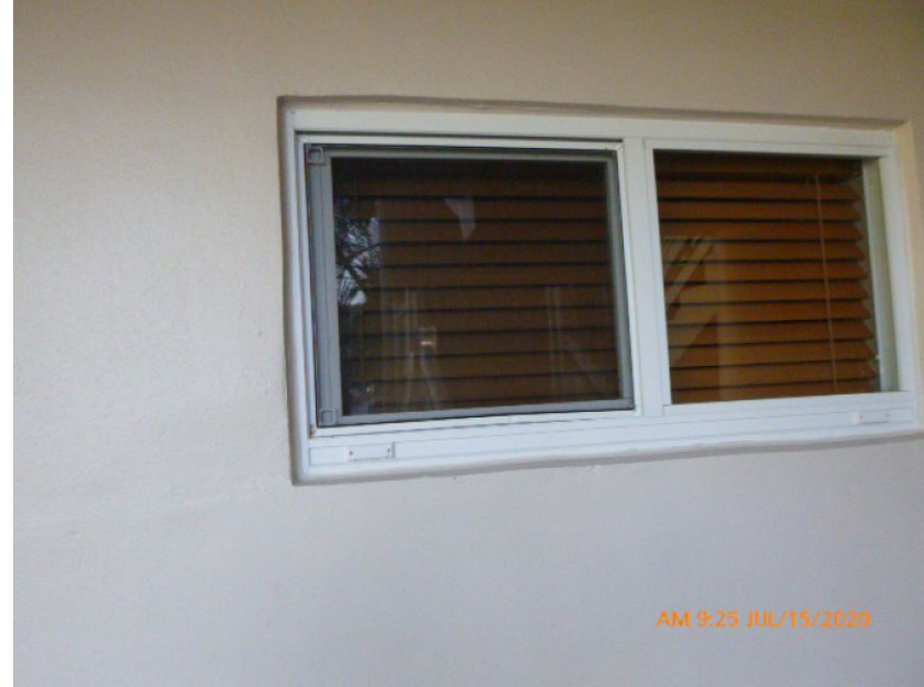
Impact Rated Window