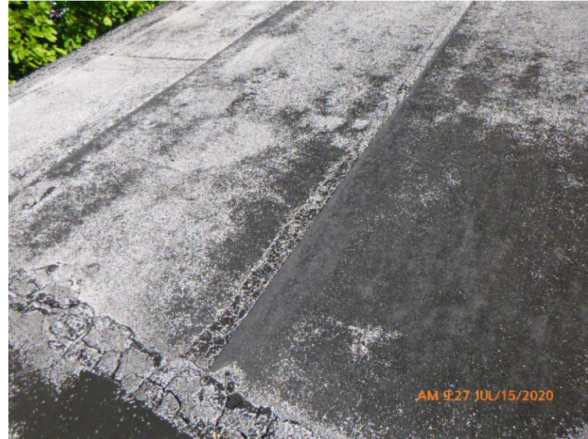
Built-Up/Rolled Asphalt Roof Covering