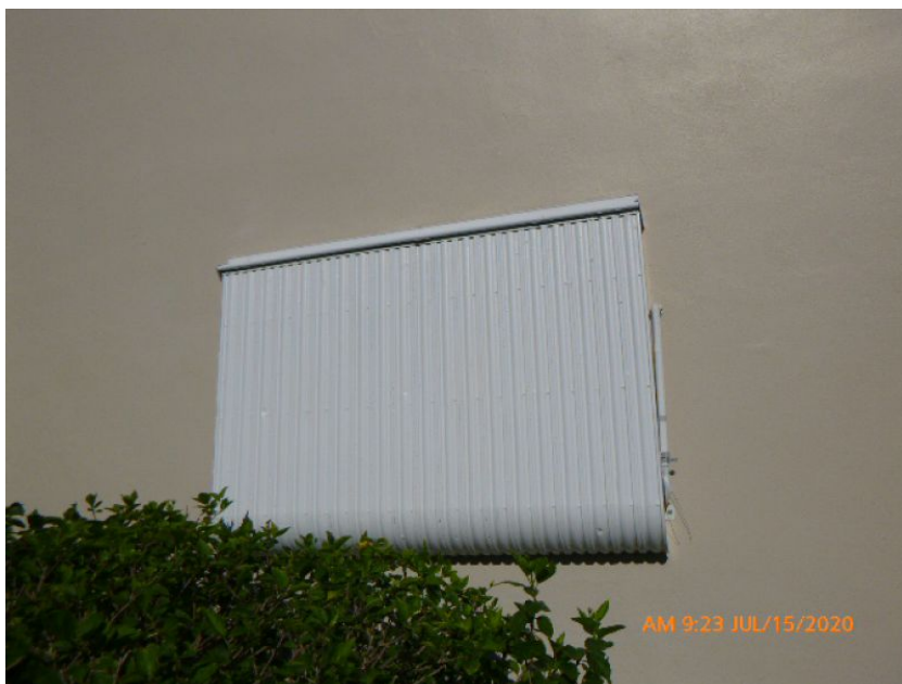
Non-Impact Rated Clamshell Awning Shutter