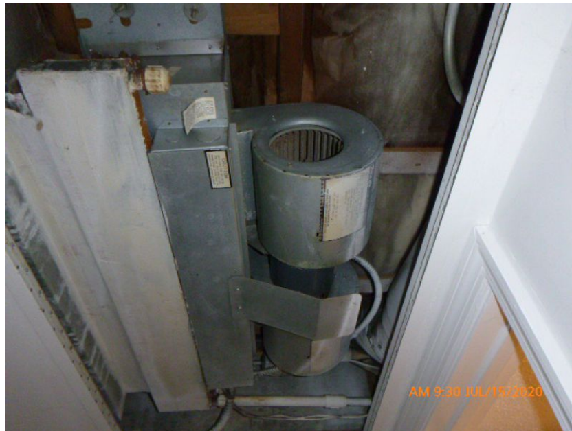
No Attic Access