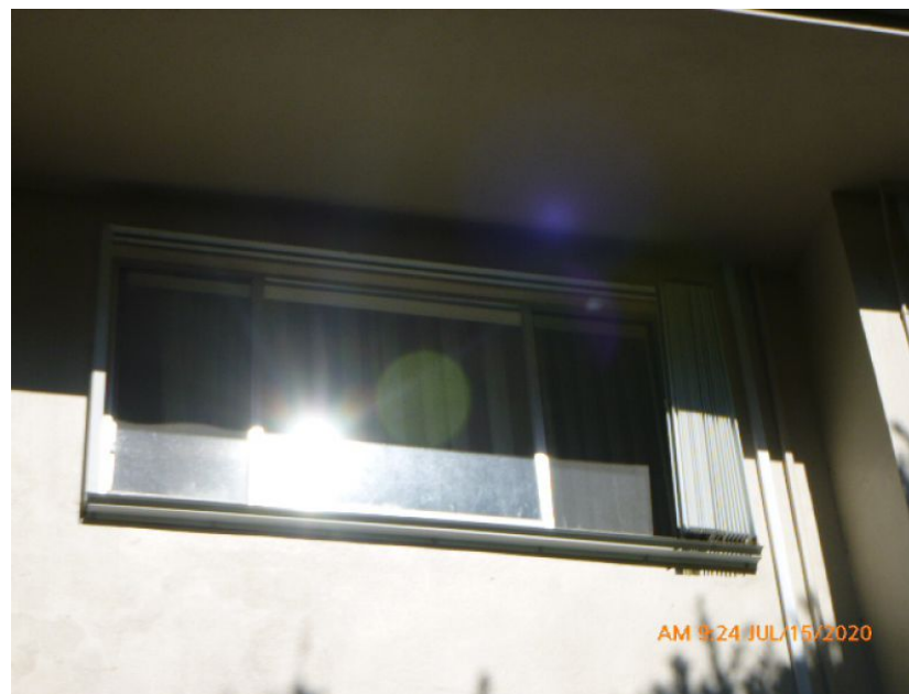
Non-Impact Rated Accordion Shutter