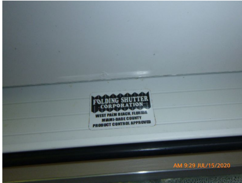
Impact Rated Rolldown Shutter Label