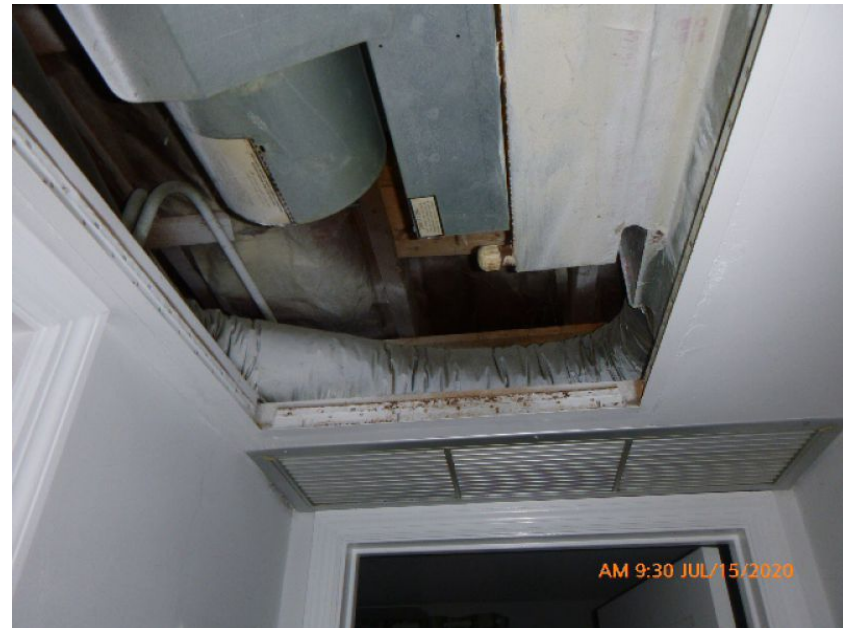
Attachment Unknown due to No Attic Access