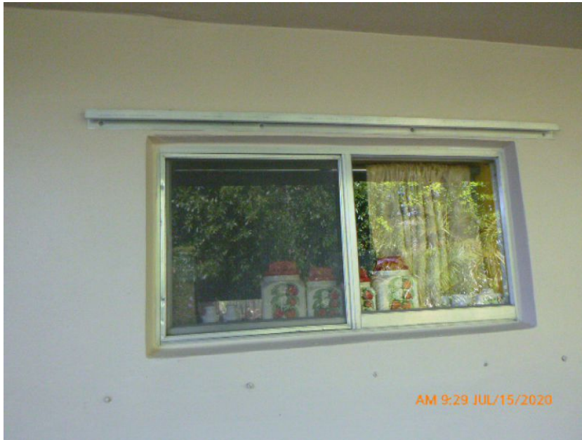
Panel Shutter - Unverified as Impact