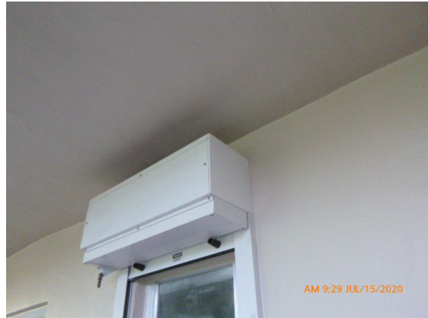
Impact Rated Rolldown Shutters