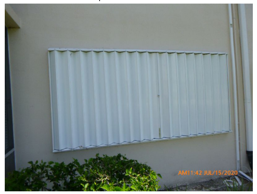
Non-Impact Rated Accordion Shutter