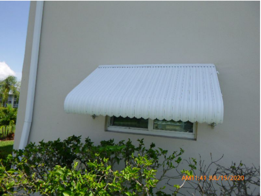
Non-Impact Rated Clamshell Awning Shutter