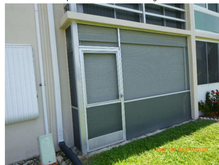
Non-Impact Rated Roll Down Shutter