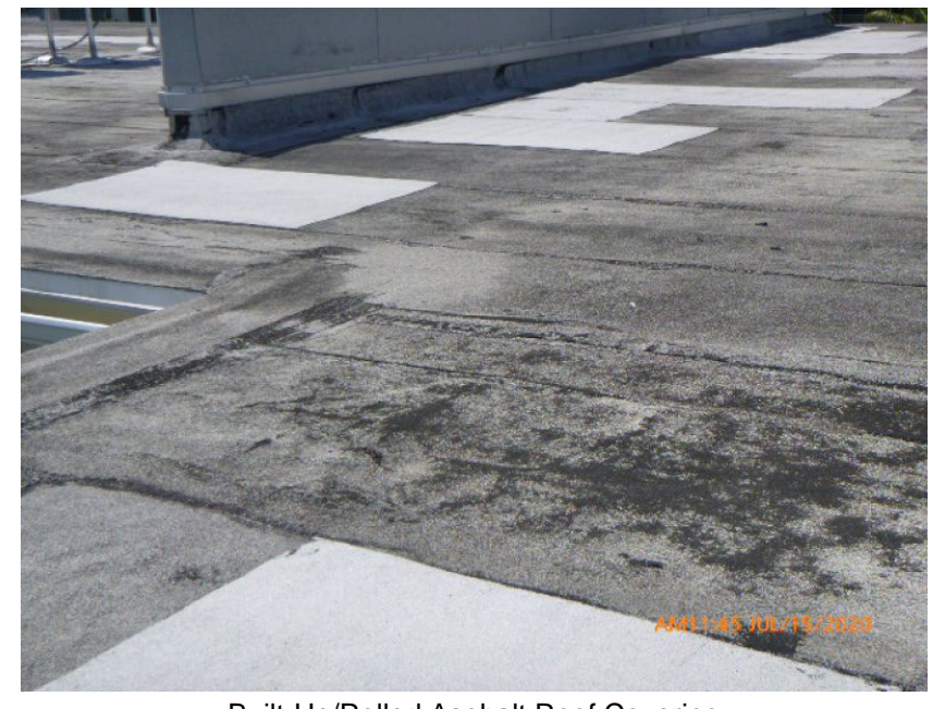
Built-Up/Rolled Asphalt Roof Covering