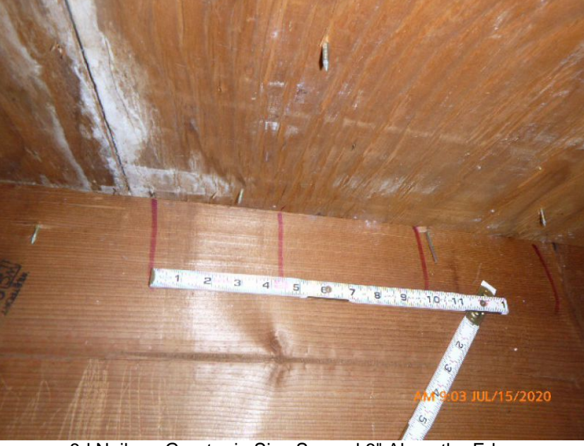
8d Nails or Greater in Size Spaced 6" Along the Edge