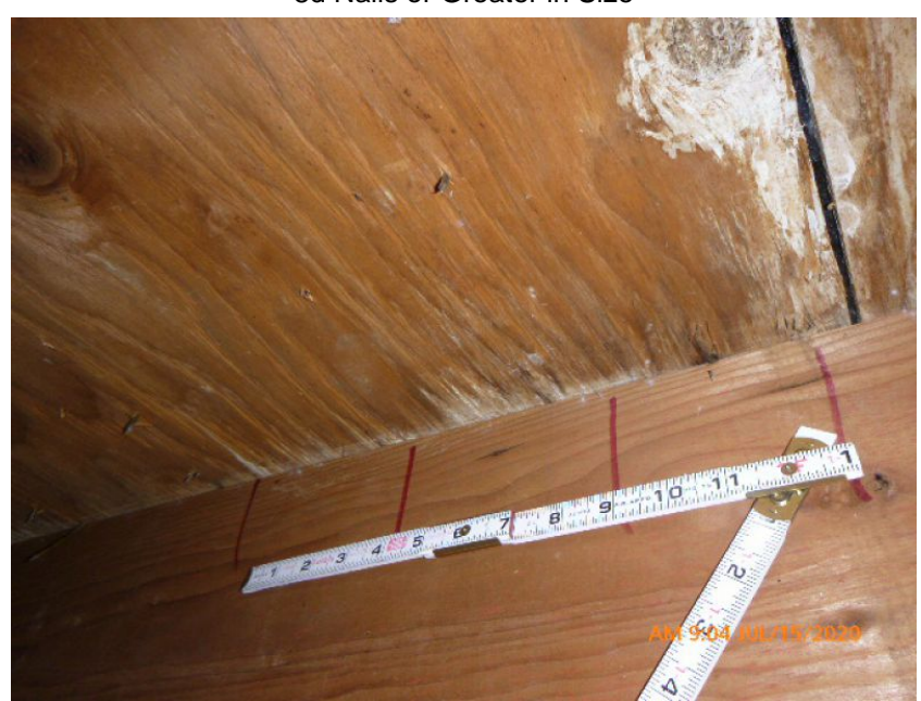
8d Nails or Greater in Size Spaced 6" in the Field