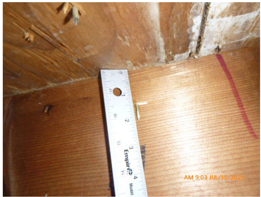
8d Nails or Greater in Size