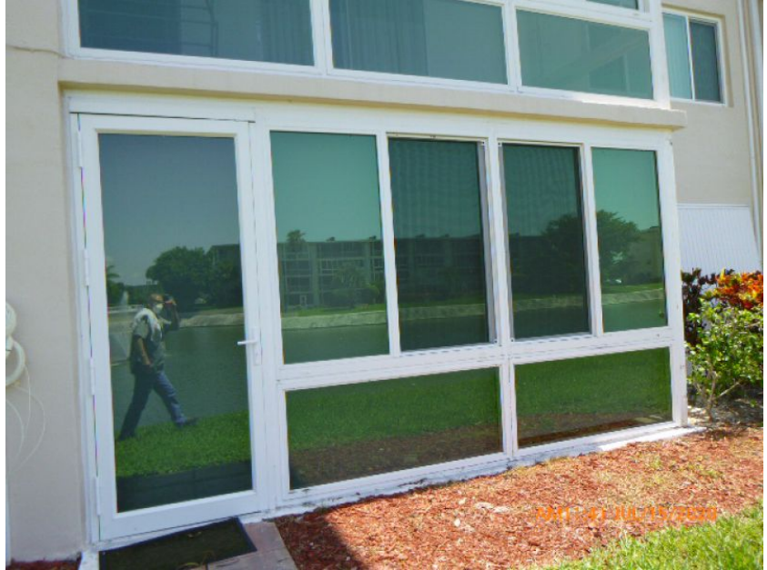
Impact Rated Window