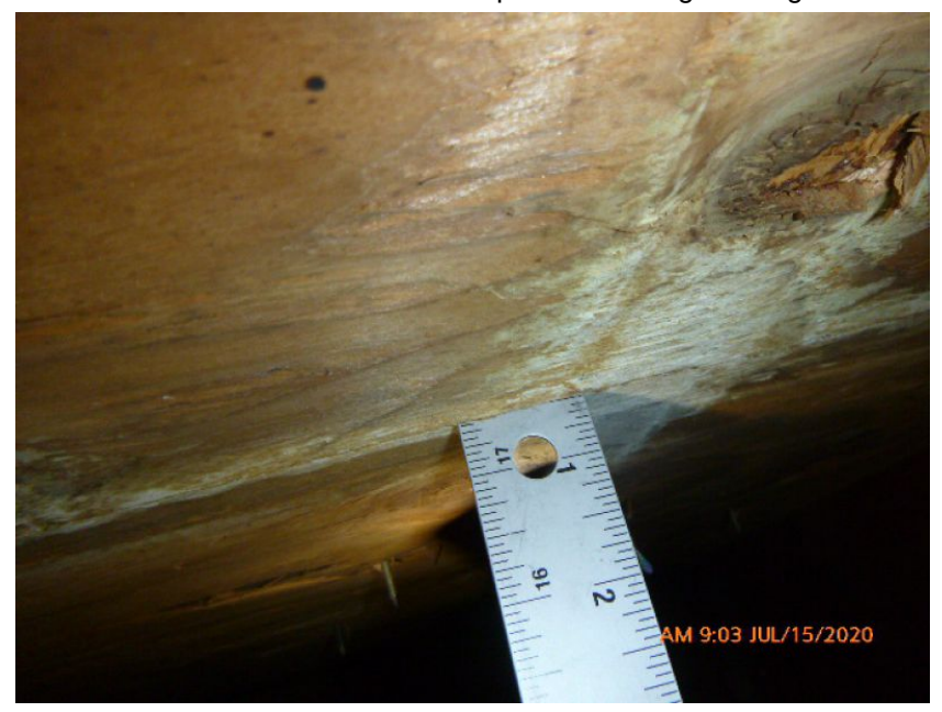
19/32" Deck Thickness Confirmed